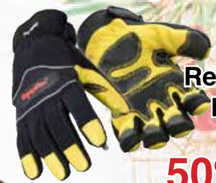
Refrigiwear Insulated Gloves