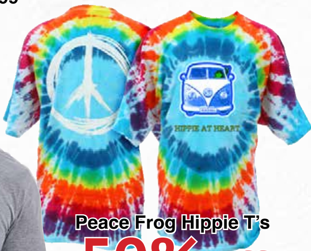
Peace Frog Hippie T's

Buy 1/Get 3 Pairs FREE Retail Price $19.99