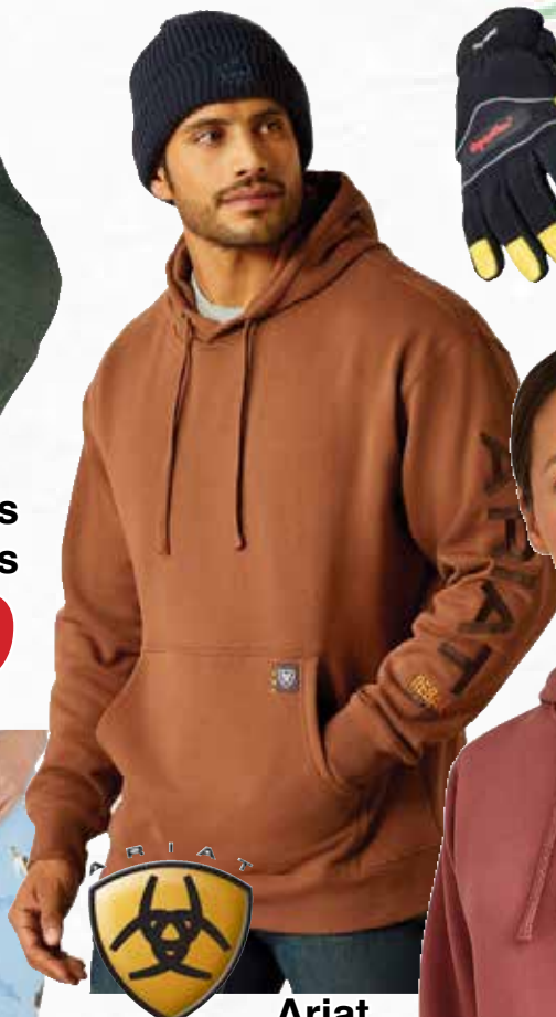
Ariat Men's & Women's Hoodies