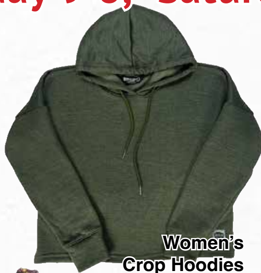
Women's Crop Hoodies